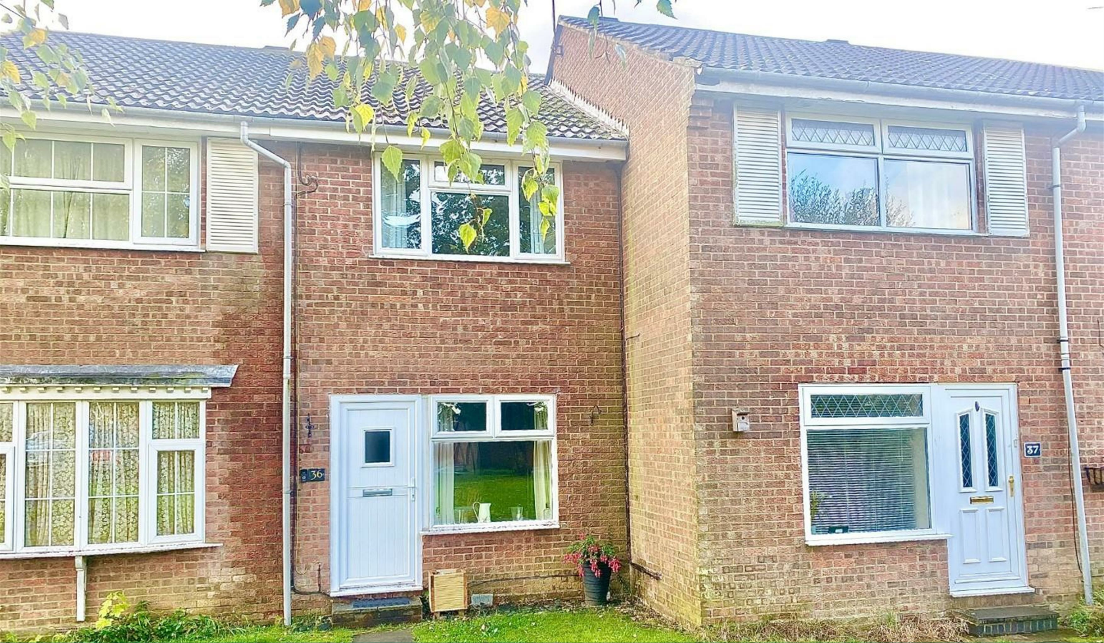
36 Breach Close Brixworth, Northamptonshire